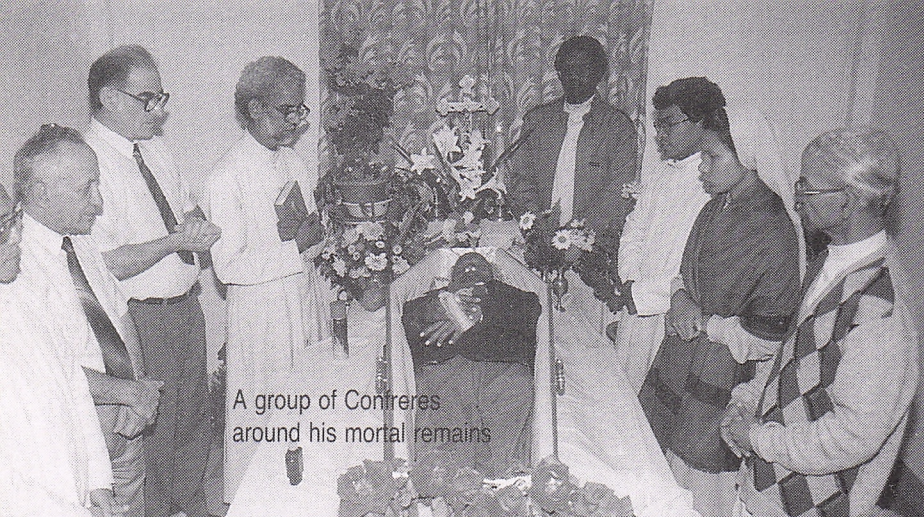
A group of confreres around his mortal remains