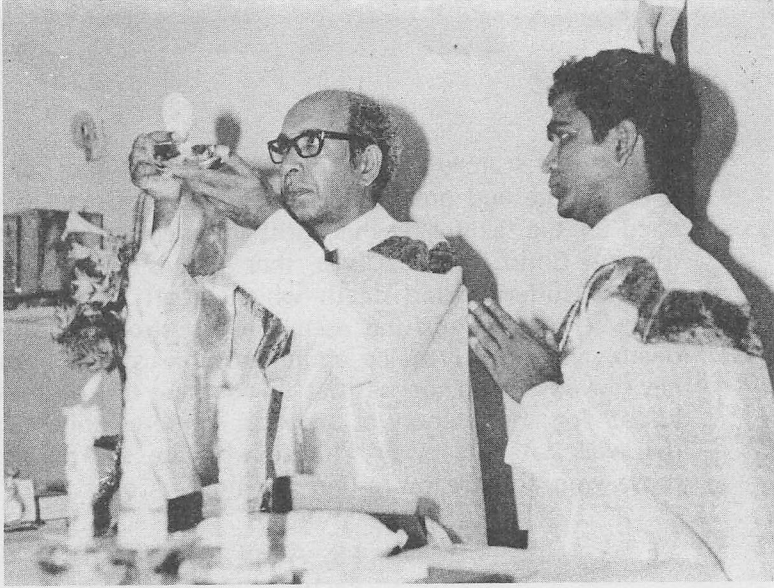
MOMENTS WITH THE LORD