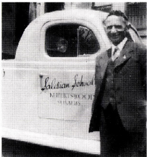
Sunbury C. 1950

Born ..... 18 December 1907 Professed ..... 17 September 1927 Died ..... 15 August 1994