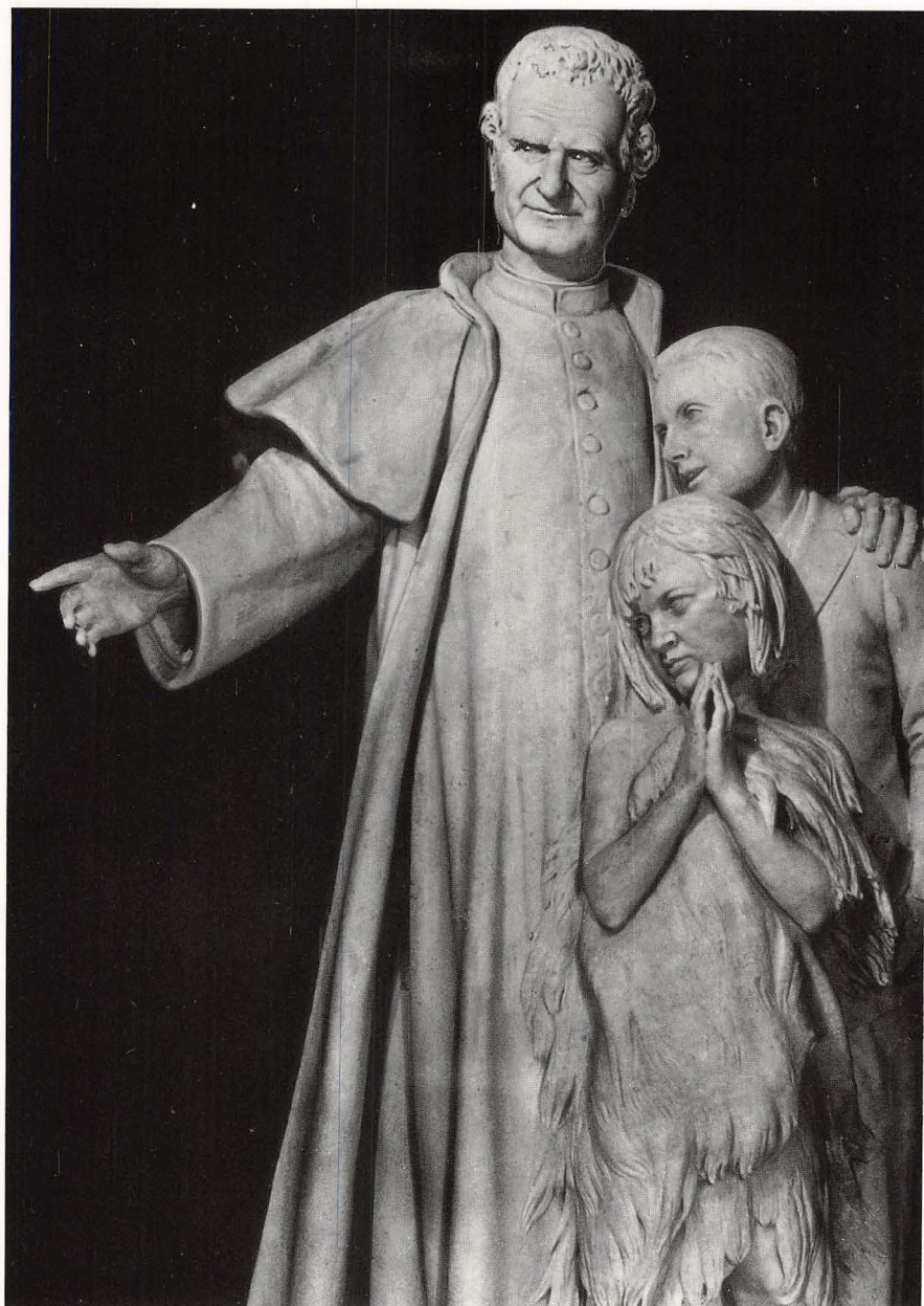
Don Bosco's Statue In St. Peter's, Rome