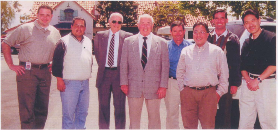
An Automotive Reunion of Teachers, Students, & Learning Shared...