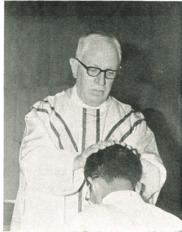
Born at San Vito al Tagliamento (Udine—Italy) on 23.8.1905 Died in Calcutta (India) on 25.4.1975