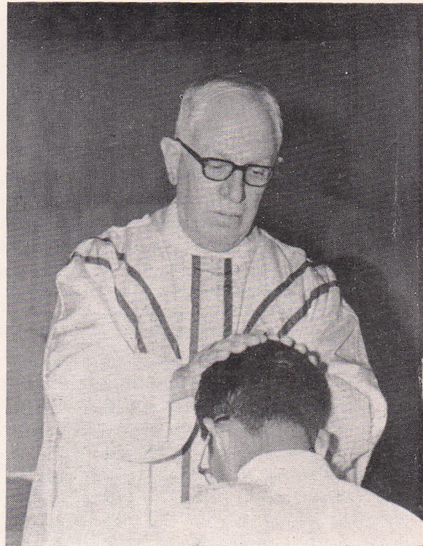
Born at San Vito al Tagliamento (Udine—Italy) on 23.8.1905 Died in Calcutta (India) on 25.4.1975