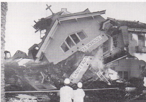
The End of St. Francis School