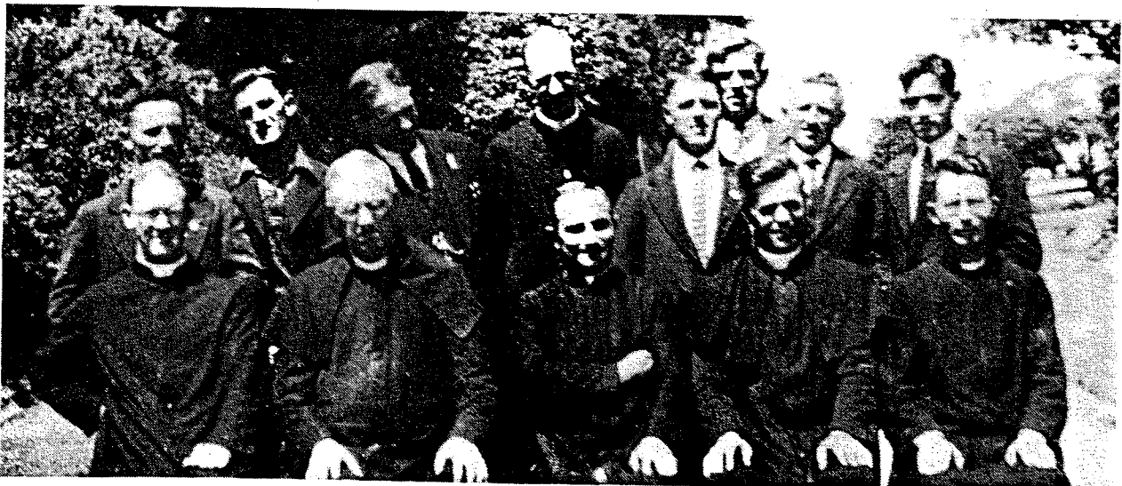
"RUPERTSWOOD" DECEMBER 1936

From 1919 to 1923 he studied theology in Turin and was ordained in the Basilica of Mary, Help of Christians on the 22nd September. On his ordination card he had written: "O Lord, teach me good sense and knowledge" (Psalm 119).