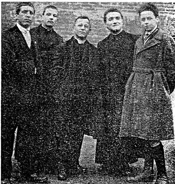
ABOVE: Brunswick 1955.