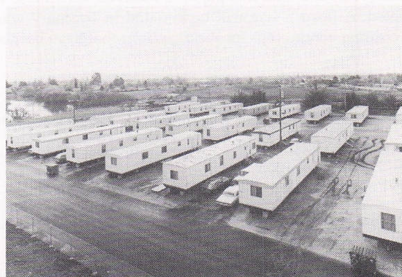
New Beginnings: Shelter for the Earthquake Homeless