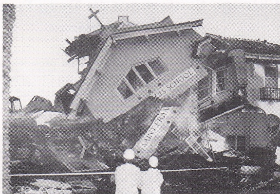
The End of St. Francis School